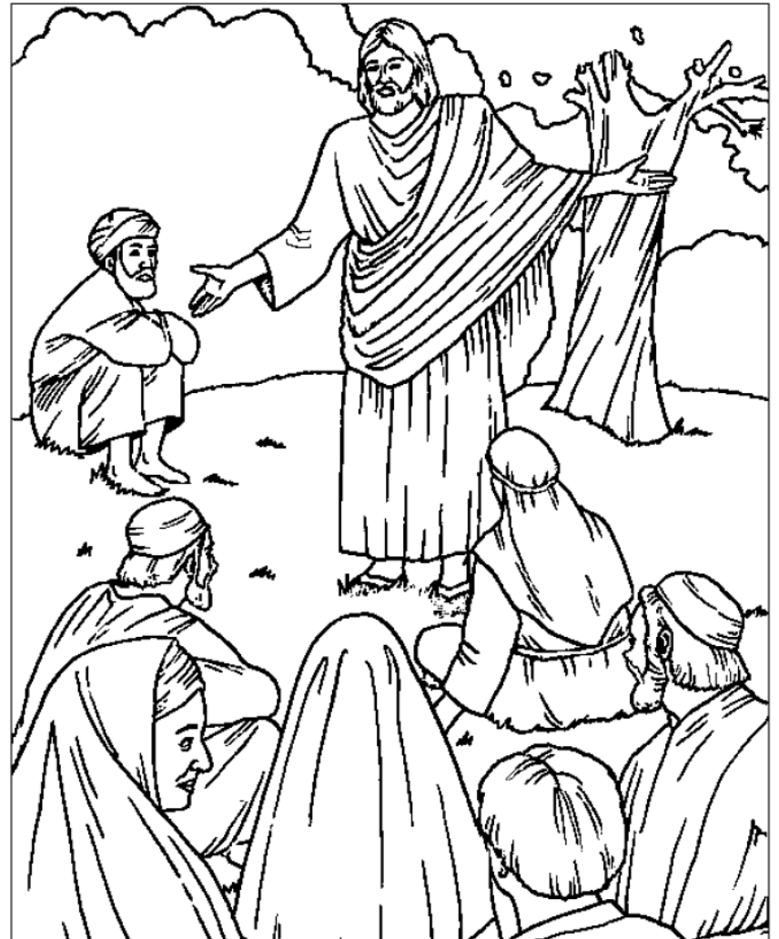
The Sermon on the Mount Mathew 5:1-12

"Rejoice and be glad, because great is your reward in heaven." Matthew 5:12a (NIV)