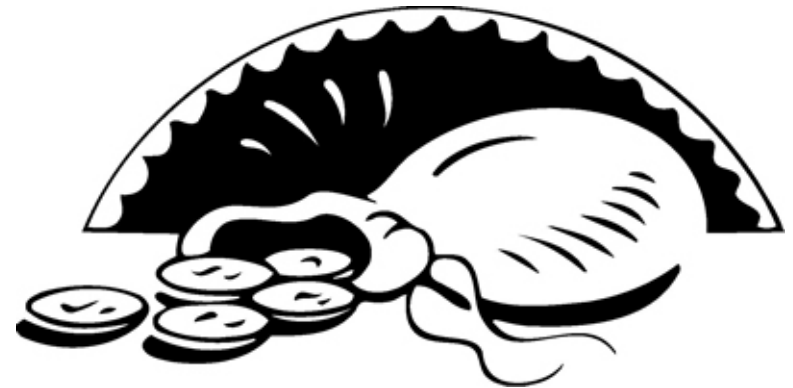
The Parable of the Lost Coin Luke 15:8-10